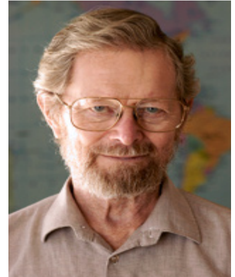
(l-r) Dr. Herb Kroemer Dr. George E. Smith